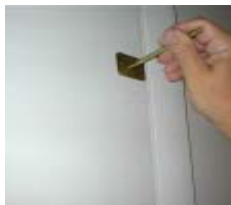
Emergency release key